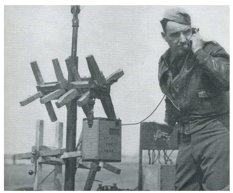
Phoning the radio headquarters in Puff Target Practice, 1938.