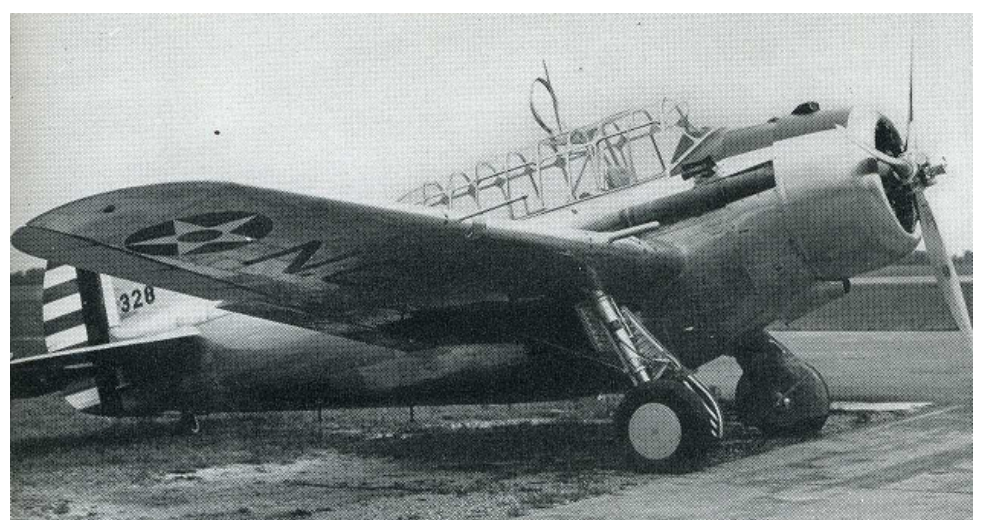
Ohio National Guard O-47, 1938 (US Army National Guard)