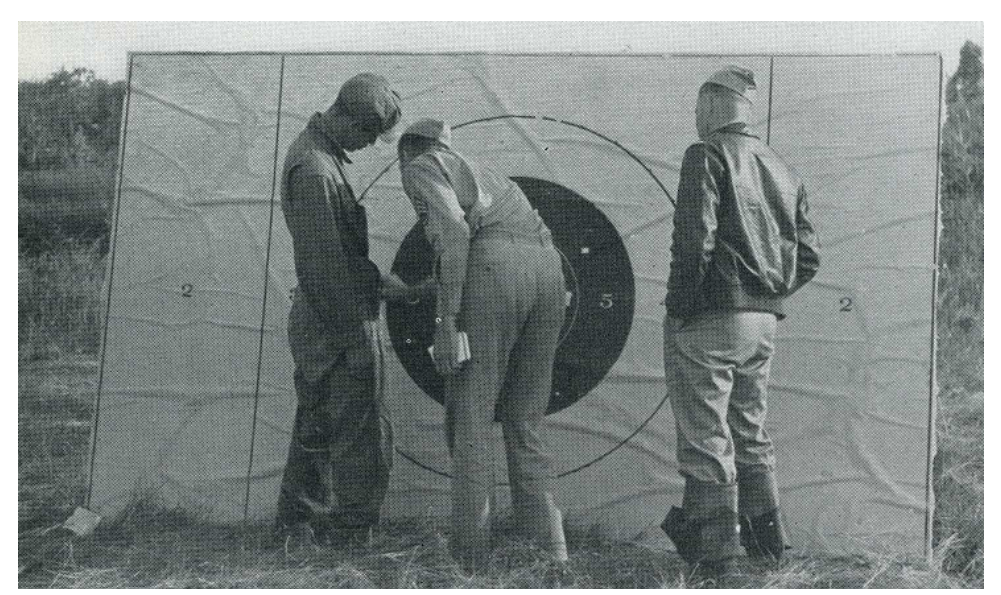
Inspecting a target. 1938. (US Army National Guard)

USAF Unit Histories Created: 29 Sep 2010 Updated: 8 Aug 2012